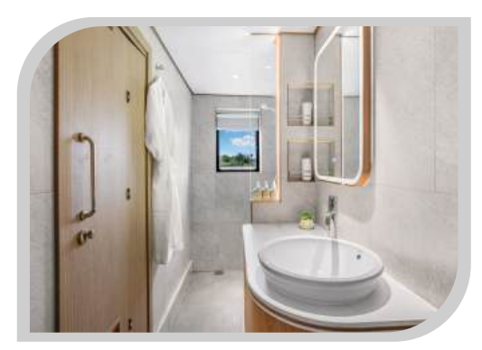
Upper Deck Ensuite